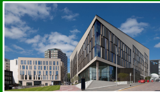
Venue: Technology & Innovation Centre, University of Strathclyde, Glasgow, UK

ISIC 2023 is organized on behalf of the EFCE working party on crystallization and is held jointly with the 2023 BACG annual meeting